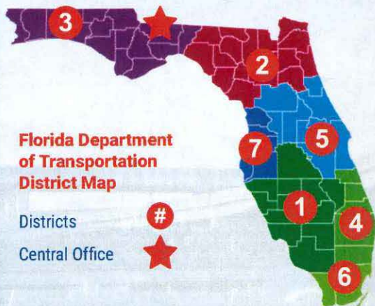
Florida Department of Transportation District Map

The Florida Department of Transportation (FDOT) is an executive agency reporting directly to the Governor. FDOT plans, develops, implements and maintains a safe, viable, and balanced state transportation system serving all regions of the state. Florida's transportation system includes roadway, air, rail, sea, spaceports, bus transit, and bicycle and pedestrian facilities. FDOT consists of seven Districts, the Central Office located in Tallahassee and the Florida's Turnpike Enterprise.